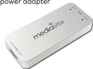
USB HDMI capture dongle